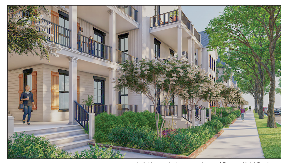
Artist's rendering courtesy of Dover Kohl Partners

The inclusion of 600 apartments in the Villages of Summerfield Farms's development plan has been one of the main points of contention for opponents of the plan. Landowner/developer David Couch and his team argue that a small number of garden-style apartments such as those depicted in this artist's rendering will offer more affordable housing options and help make Summerfield a more inclusive community.